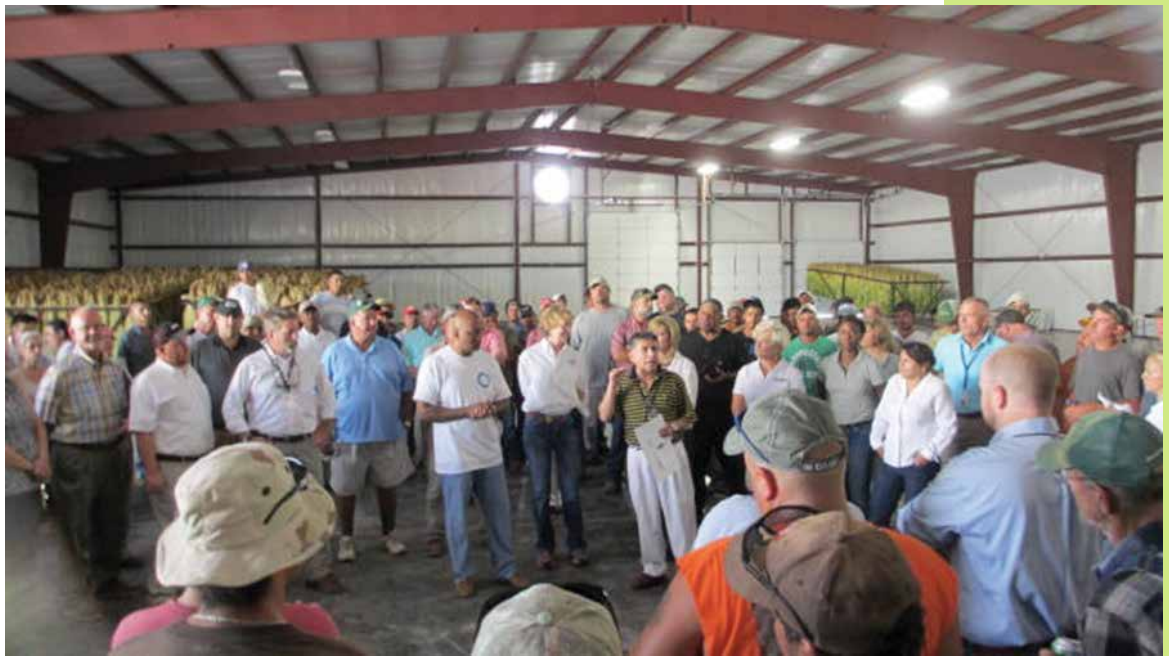
Tennessee OSHA conducts on-farm safety and health training.

In addition, TOSHA will adopt the Electric Power Generation, Transmission and Distribution final rule on Jan. 1, 2015.