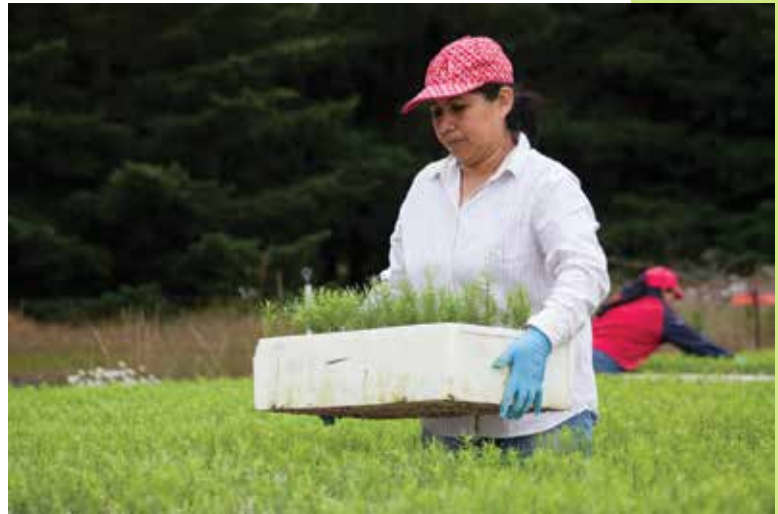
DOSH has a Hispanic Outreach Program to connect with Spanish speakers on safety and health issues.

DOSH's Education & Outreach Services program has developed and launched a new eLesson on the Globally Harmonized System of chemical classification and DOSH rule updates. This eLesson is created in a way that uses methods of adult learning by providing a wide range of interactions, including a live training host/instructor to walk users through the lesson, information about the new SDS labels, the ability to click and directly access related website resources during the lesson, and a quiz to match GHS pictograms with their applicable hazards. This training tool can be used by individuals as well as employers wanting to provide information to all of their workers at one time. DOSH will develop more eLessons in the near future. This eLesson can be seen at http://wisha-training.Lni.wa.gov/training/articulate/GHSHazCom/story.html .