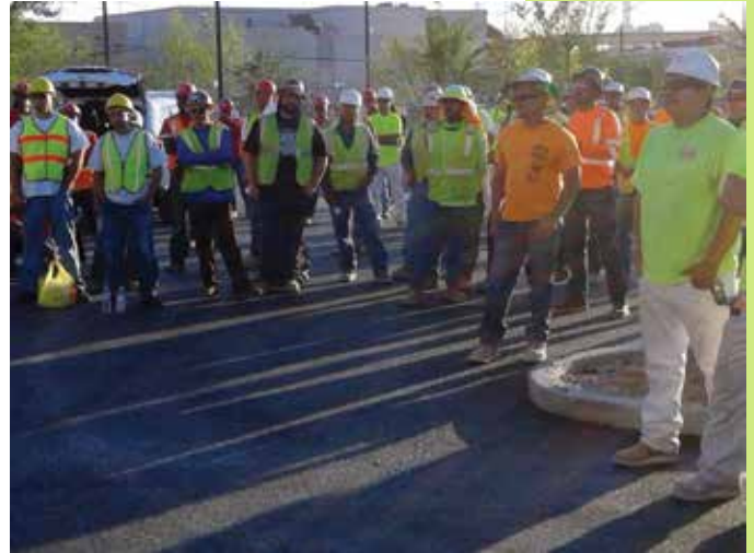
Construction workers for Martin Harris Construction stop work for training on fall protection during the National Fall Protection Stand-Down.

Fall protection awareness continued to be a high priority for SCATS. The National Safety Stand Down to prevent falls in construction was a major success that allowed us to partner with several construction firms, such as The Penta Building Group and Martin-Harris Construction, at multiple events, reaching more than 1,000 employees. Local media coverage also helped raise awareness among employers and workers about the hazards of falls, which account for the highest number of deaths in the construction industry.