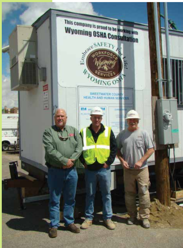
Wyoming OSHA has 63 employers participating in VPP, SHARP, and EVTAP (pre-SHARP program).

Recent legislation has enabled Wyoming OSHA to offer workers' compensation base rate premium discounts to employers willing to work with OSHA consultation or qualified private consultants. The program is set up on a four-tier structure with increasing discounts based on the level of achievement by an employer. The discounts are applied to the employer's workers' compensation account the calendar year quarter after a consultation occurs, if the employer complies with all elements of the program and abatement is satisfied. These discounts continue for three calendar years after which time the employer may reapply. Depending on the participation level the employer chooses, base rate premium discounts of 3 percent, 5 percent, 7 percent, or 10 percent can be applied. Audits and annual commitments are part of the program package. This program is new, but based on the number of employer inquiries, Wyoming OSHA anticipates the use of the program will be substantial.