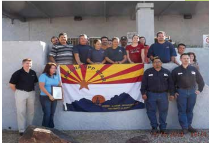
Phoenix-based Insulfoam successfully completed its second VPP STAR recertification.

Over the past year, three of the 13 have successfully completed the program with decreased injury/illness and DART rates. ADOSH observed that the average rate reduction in injuries/illnesses for the three companies was 30 percent from where they previous