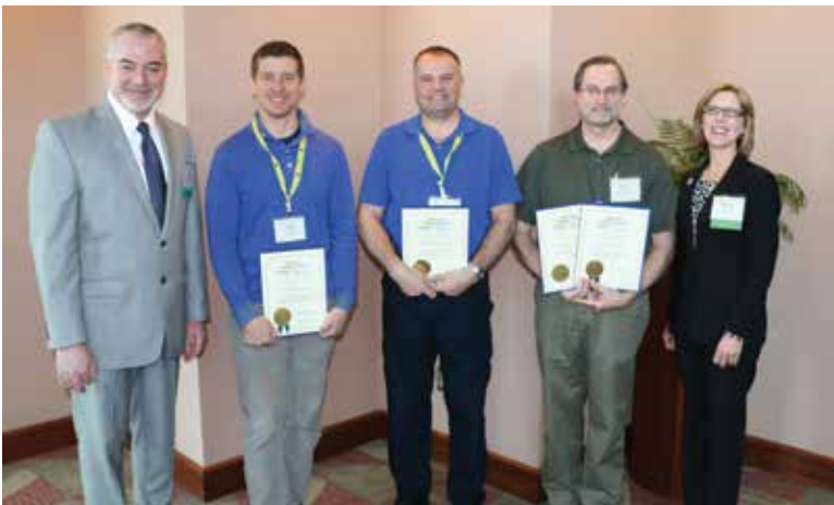
MTI boot camp graduates are recognized at the 2014 safety conference.

MIOSHA Training Institute (MTI): Since its inception in 2008, MTI training has been provided to more than 16,300 individuals and certificates have been issued to more than 857 students. The first Level Two Boot Camp was conducted in fiscal year 2013 and received positive feedback from attendees. The Level Two Management Boot Camp is designed for general industry and construction supervisors, managers, and safety coordinators and provides in-depth information on the administration and management of workplace safety and health systems. The boot camp compressed the series into a six-day session, allowing attendees to receive the training in a faster, more consistent manner and reduced their travel time and costs.