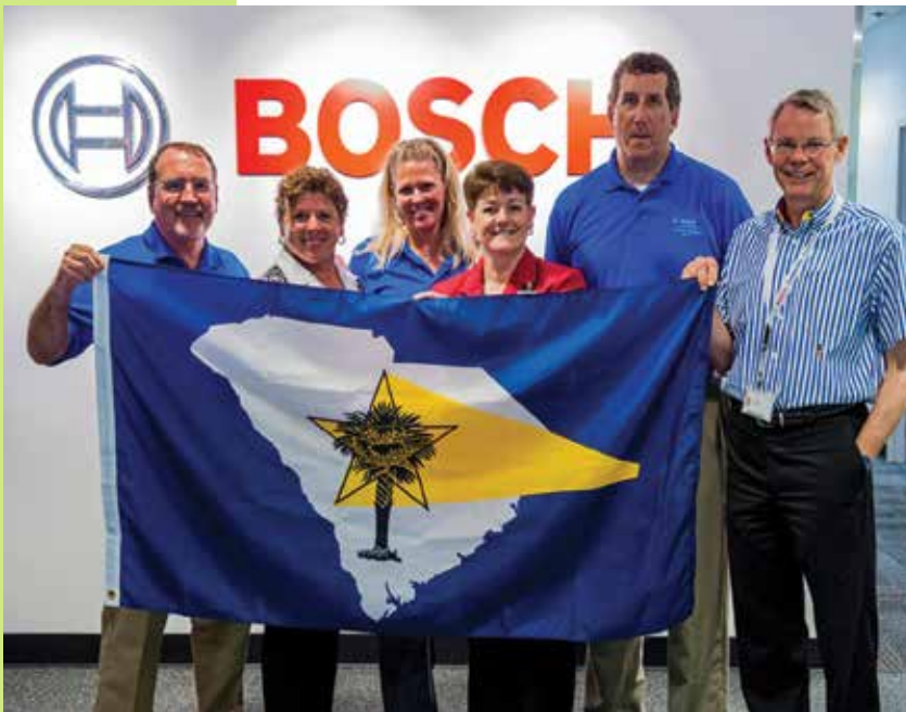
The Robert Bosch facility in Anderson was accepted into South Carolina's VPP Palmetto Star program on June 12, 2014.