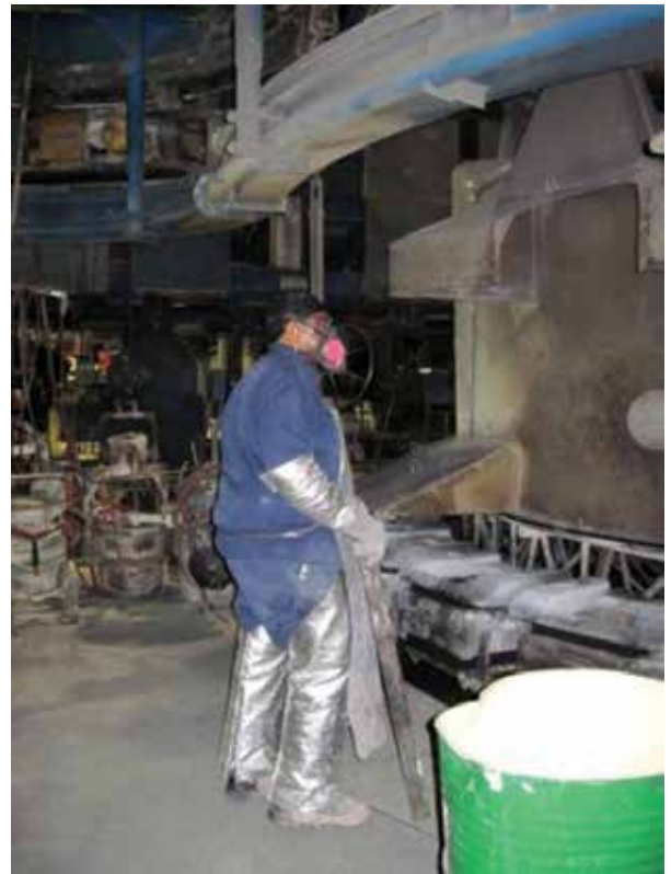
Employees at RE Cook Inc. work on a melting deck/ metal transfer area of the foundry.

During these inspections, 1,993 violations were issued. Of these violations, 1,395 (70 percent) were serious violations, 591 (30 percent) were other-than-serious violations, and seven (0.4 percent) were repeat violations. Adjusted penalties for these violations were $562,946.00.