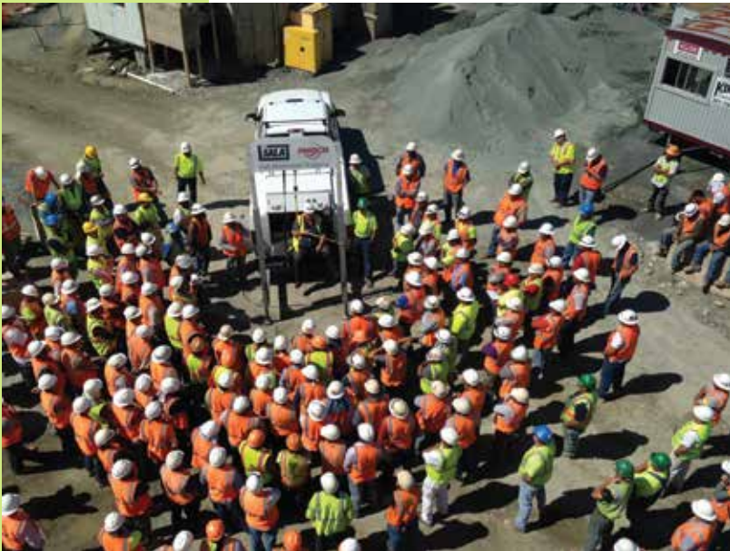
MOSH participated in the National Stand-Down for Fall Protection in Construction.

MOSH is investigating the fatality of an employee who fell from a water tower. The employee was attempting to work on cell/radio antennas when he fell approximately 180 feet from the tower. MOSH is working with federal OSHA and local experts to determine the exact circumstances surrounding the employee's fall. MOSH requested the assistance of a retired fire lieutenant who was highly trained in tower and vertical rescue and safety procedures. MOSH secured a Go Pro camera in order to maintain communications with the climbing crew and instruct the climbers on exactly what measurements and photos were needed. The expert and an assistant climbed the tower and took numerous measurements, videos, and photographs that will aid the inspection team in determining what events led to the employee's fall. The case has not been closed as of this report.