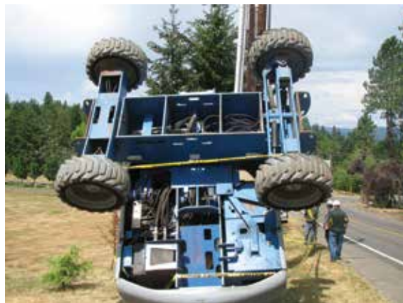
An aerial lift tipped over on a sloped surface, throwing the worker 10 feet. He did not survive the accident.