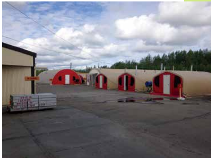
The tent camp in Galena, Alaska, where rebuilding is under way following flooding in 2013.

The Governor's Denali Peak Performance Award is a program that recognizes excellence in public service. Thousands of state employees have been recognized since the program's inception for their dedication to excellence in their jobs. This year, five AKOSH consultation and enforcement employees received this award for going above and beyond the call of duty to go to Galena, a remote part of Alaska, after severe flooding and live in tent camps to help workers and residents avoid injury and illness during cleanup operations.