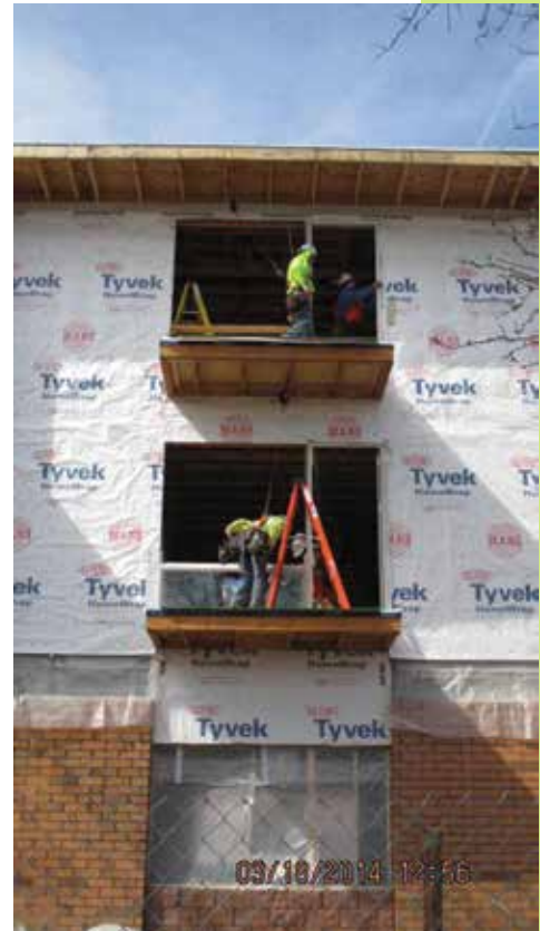
Carpenters tying off for the Residential Construction Initiative.

Connecting MIOSHA to Industry: MIOSHA is continuing its very successful initiative, “Connecting MIOSHA to Industry.” The goals are to support active safety and health systems, decrease workplace safety and health hazards, expand partnership opportunities, and, therefore, increase the competitiveness of Michigan employers. Overall, the initiative is linking MIOSHA’s legislative mandates with opportunities to interact with employers and workers to create collective ownership for the safety and health of Michigan’s workforce. Special outreach activities include coffee with MIOSHA opportunities and the annual Take a Stand Day event.