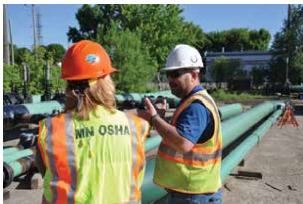
MNOSHA established a cooperative safety and health partnership with contractors constructing a four-lane bridge spanning the St. Croix River between Minnesota and Wisconsin.

MNOSHA also entered into a partnership agreement with the Minnesota Department of Transportation and a contractor for the construction of the piers for the St. Croix Crossing project. The pier project consists of the construction of five river piers to a height of 15 feet above nominal river elevation. The St. Croix Crossing project is a major construction project replacing the 80-year-old Stillwater (Minnesota) Lift Bridge with a four-lane bridge spanning the St. Croix River and connecting two expressways between Oak Park Heights, Minn., and St. Joseph, Wis.