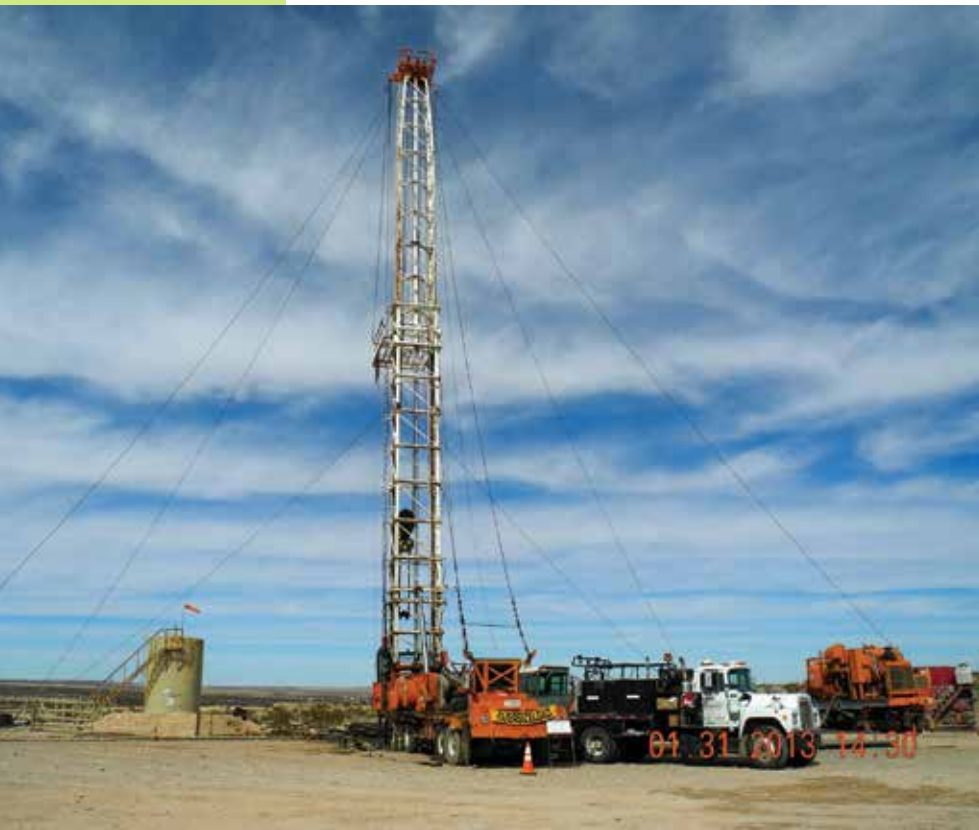
The New Mexico OHSB entered into an alliance with the state's Oil and Gas Association to reduce incidents at sites such as this oil well servicing operation in southeast New Mexico.

Occupational Health and Safety Bureau — NM OHSB