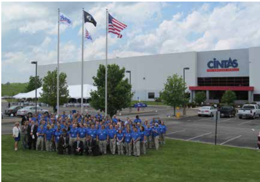
Cintas in Grayson joined the VPP program in 2013.

Thirty-five Kentucky companies received the Governor’s Safety and Health Award at the event. The award recognizes employers and employees who together achieve a required number of hours worked without experiencing a lost-time injury or illness. An additional 21 companies received the Governor’s Safety and Health Award at their facilities. Combined, the companies represent more than 8,500 employees and more than 67.5 million hours worked without a lost-time incident.