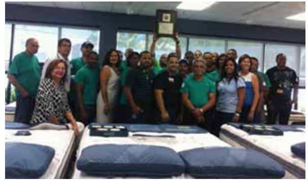
Puerto Rico site receives SHARP designation.

The consultation personnel have been training and prepared to provide the 10 and 30 hours outreach training for both general industry and construction industry.