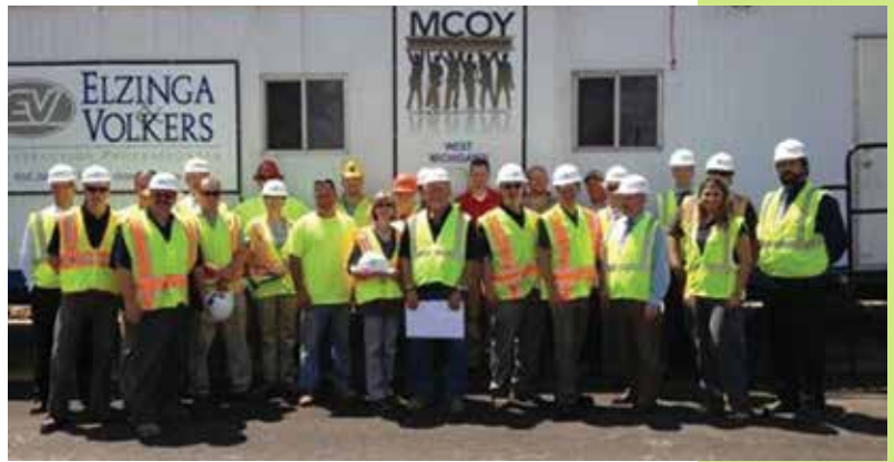
Elzinga & Volkers Inc. contractors signed a partnership to protect workers during construction at the Spectrum Health ICC Beltline Project.