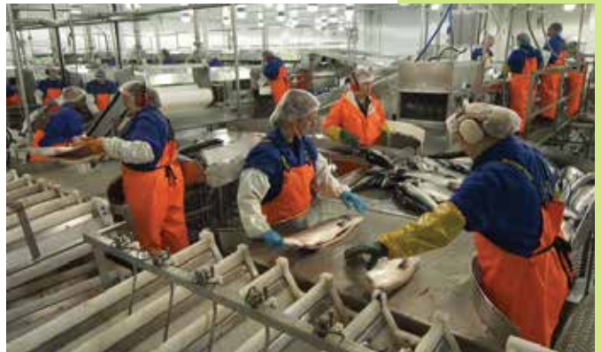
Consultation is working to educate the seafood processing industry about safety hazards.