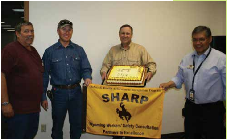
Forty-three employers in Wyoming participate in SHARP.

These alliances have been critical in building cooperation between industry sectors and Wyoming OSHA to advance efforts to ensure the health and safety of employees working in high-hazard occupations in Wyoming. In addition, Wyoming OSHA has collaborated with a new Transportation Safety Coalition in an advisory capacity to reduce workplace transportation fatalities. Transportation fatalities account for approximately half of all workplace fatalities occurring in Wyoming each year.