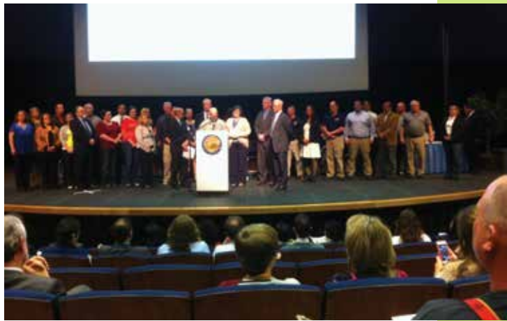
The Governor's Denali Peak Performance Award presentation to the Alaska OSHA program for participation in the recovery efforts in Galen, Alaska.