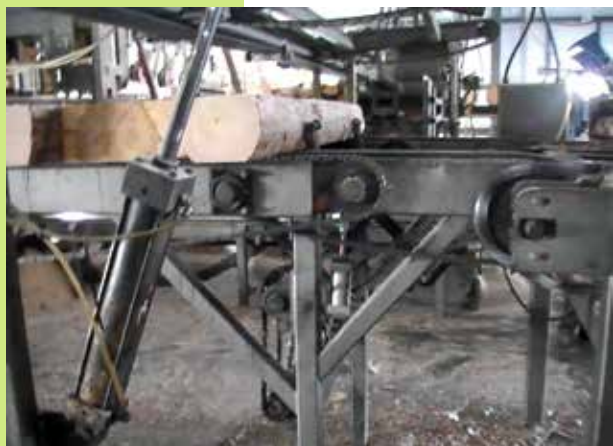
Cants (Cant is the logs) being transferred via a conveyor with unguarded chain and sprockets.

Wood Products Manufacturing: This industry was selected for outreach and enforcement activities in 2014 as it continues to have an above-average injury and illness rate. In 2011, wood products manufacturing had a total recordable case rate of 5.3 injuries and illnesses per 100 workers per year, compared to the state average of 3.9. To help reduce this rate, MIOSHA launched a local emphasis program (LEP) and will conduct at least 10 programmed inspections in wood products manufacturing during fiscal year 2014.