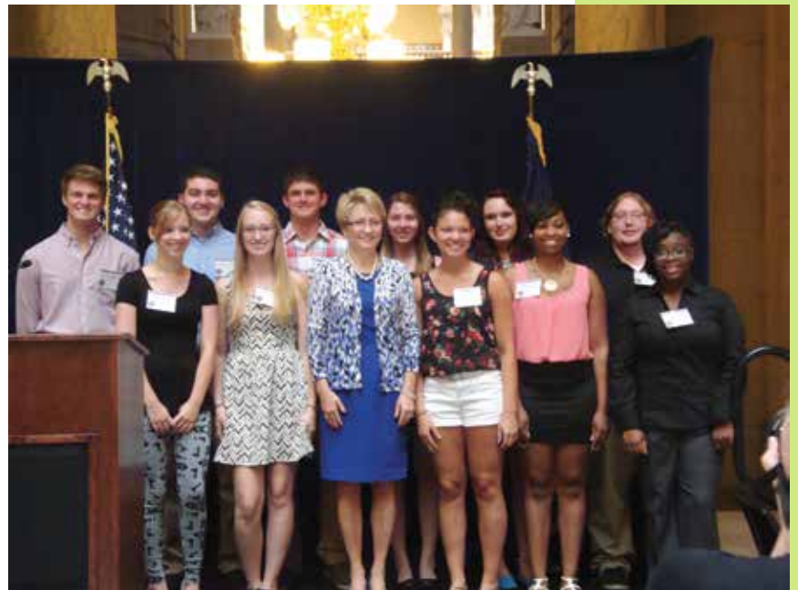
Young people in Indiana were challenged to develop a social media message to promote the dangers of texting and driving.

The Indiana Department of Labor and Indiana Department of Transportation worked together to develop a distracted driving working group. The working group consisted of representatives from the Indiana Department of Labor, Indiana Department of Transportation, Indiana Bureau of Motor Vehicles, Indiana State Police, and the Indiana Criminal Justice Institute's Traffic Safety Division.