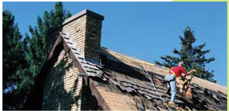
The Residential Construction Initiative helps companies focus on the top five serious hazards.

Residential Construction Initiative: MIOSHA launched a residential construction initiative to assist employers in protecting their workers from the most common serious hazards associated with residential construction. The initiative is in effect from May 15, 2014, through May 15, 2015. MIOSHA developed this initiative with the Home Builders Association of Michigan. The initiative includes an LEP that focuses inspections on the top five serious hazard categories, a new one-stop residential page on the MIOSHA website, training seminars, and a “Building Up Residential Safety Day” on Aug. 14, 2014. The Building Up Residential Safety Day is an invitation for residential employers to participate in a one-day opportunity in which enforcement officers and construction consultants conduct safety and health surveys at jobsites with no citations and no penalties.