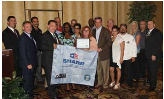
The Orleans Hotel and Casino received its first SHARP award.