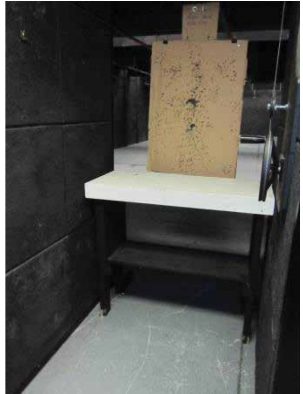
SC OSHA inspected 707 Gun Shop Inc., an indoor gun range, where employees had high blood lead levels.

The Survey of Occupational Injuries and Illnesses is a federal/state program in which employer reports are collected and processed by the agency from about 3,200 South Carolina establishments. This annual survey provides estimates of the number and frequency (incidence rates) of workplace injuries and illnesses based on logs kept by employers during the year. These records reflect not only the year's injury and illness experience, but also the employers' understanding of which cases are work related under recordkeeping rules promulgated by the Occupational Safety and Health Administration (OSHA), U.S. Department of Labor. The number of injuries and illnesses reported in any year can be influenced by the level of economic activity, working conditions, work practices, worker experience and training, and the number of hours worked. This year's survey showed that South Carolina's Injury and Illness Incidence Rate for Private Sector in 2012 was 3.0 workers per 100. The National Private Sector Injury and Illness Incidence Rate was 3.4 in 2012. Within the public sector, South Carolina's occupational injury/illness rate was 4.4 in 2012.