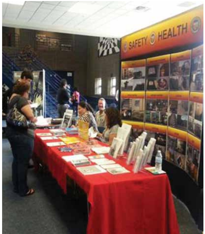
A safety training for public workers was held in Flagstaff, Ariz.

All events saw an average of 185 employers and employees in attendance. Those that attended were highly likely to attend the next ADOSH Safety Summit, as they saw it as a way to be up to date on OSHA standards and best practices.