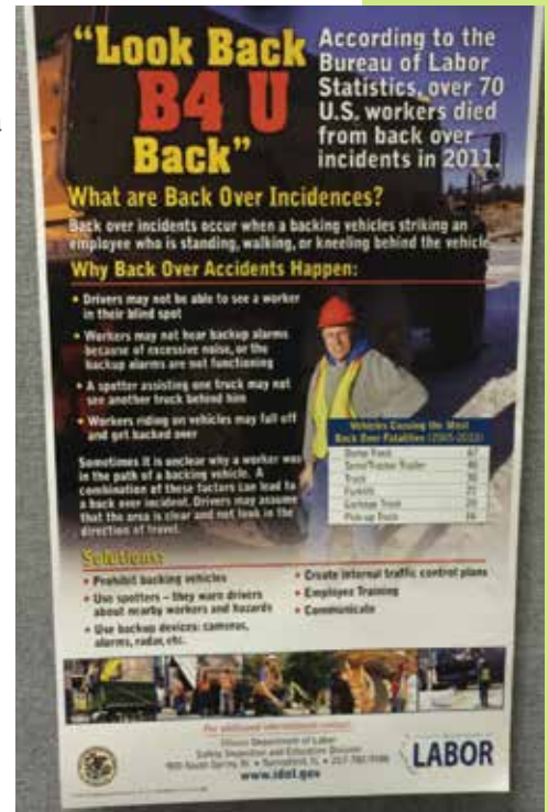
The “Look Back B4 U Back” campaign was designed to prevent back-over accidents.

The grain handling issues in Illinois were brought to the forefront with a number of recent fatalities occurring across the state in this industry. The consultation program did a focused outreach to the major grain handling companies in Illinois. The staff provided to them resource materials and educational opportunities designed to prevent future mishaps.