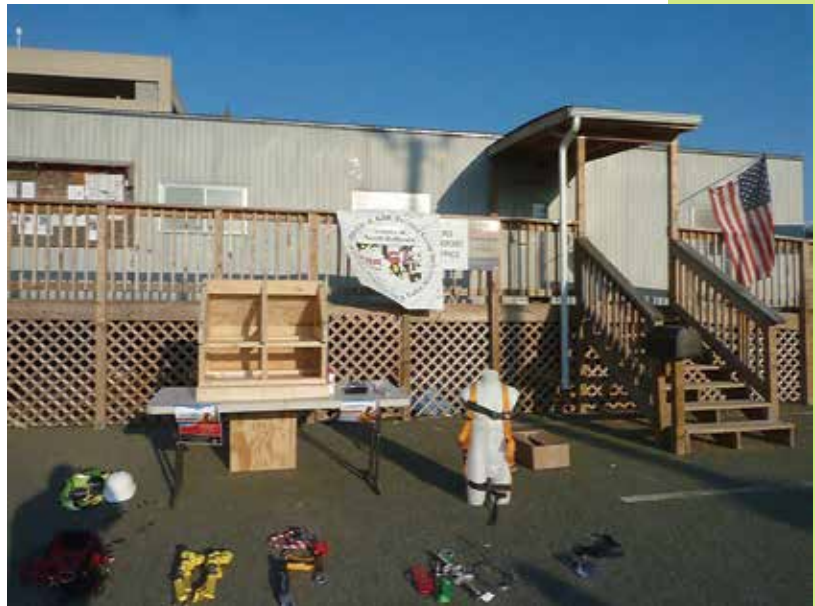
Sites in Maryland held training to participate in the National Stand-Down for Fall Protection in Construction.