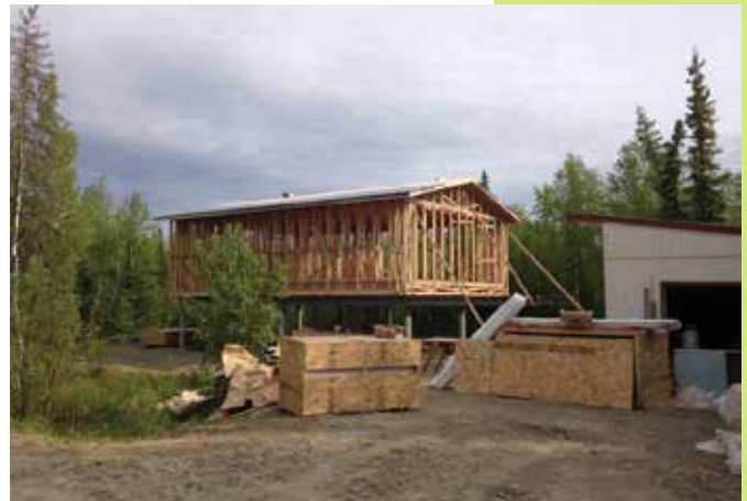
AKOSH helped in the rebuilding of Galena, Alaska, after a spring flood destroyed the community in June 2013.