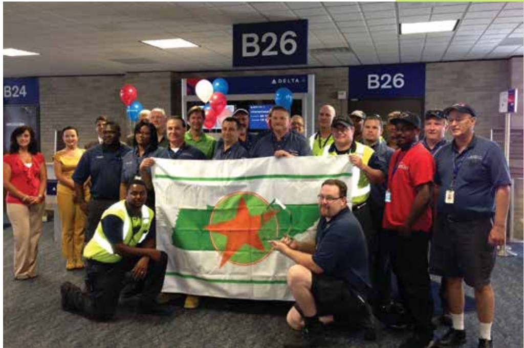
Employees of Delta Airlines' Memphis Technical Operations display their new Tennessee Volunteer STAR (VPP) flag.

The Tennessee days away, restricted, and transferred rate (DART) and total case incident rate (TCIR) continue to mirror the rates for the nation. The 2012 Tennessee DART rate for both private and public sector is 1.9 (National average = 1.8). The 2012 Tennessee TCIR is equal to the national average of 3.7.