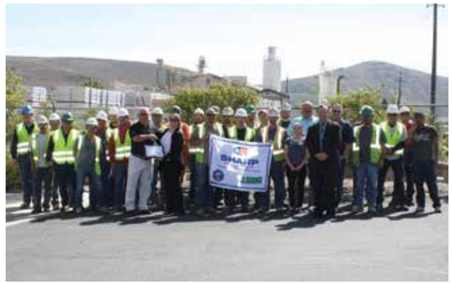
Basalite Concrete received its SHARP renewal.

SHARP: SCATS currently has 29 SHARP and six pre-SHARP sites. One of our major partners is the Boyd Gaming Group, which currently has nine properties that have attained full SHARP status. Since entering the SHARP program in 2007, Boyd Gaming has reduced total workplace injuries by nearly 75 percent annually, and saved an estimated $5 million in workers' compensation costs over a six-year period.