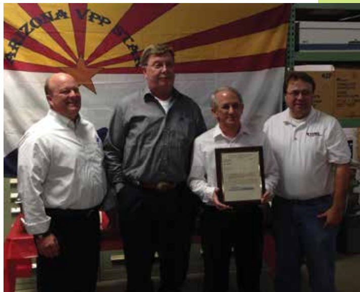
Yuma-based company Yuma Cogeneration accomplished its second successful VPP STAR recertification.

started the program. Proving that increased hazard recognition, focused training to ensure workforce had basic knowledge of hazards in the workplace, and management involvement in the process was key in driving down the rates.