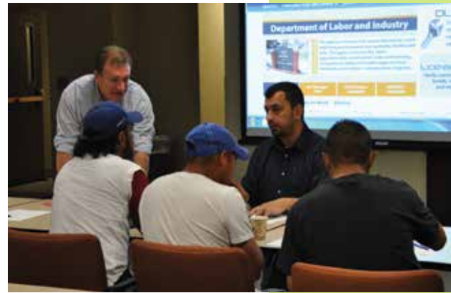
MNOSHA offered Spanish-language classes to workers about fall protection and to employers about how OSHA conducts inspections.

MNOSHA continues to strive to improve communication with immigrant and “hard-to-reach” employers and employees. MNOSHA employs two investigators who are fluent in both English and Spanish. It has updated its right-to-know handouts and MNOSHA workplace inspections booklet that are offered in Spanish and has translated 16 of its Minnesota-specific documents into Spanish. In addition, MNOSHA provides written materials to immigrant and other hard-to-reach employers in coordination with the Department of Labor and Industry’s community services representative.