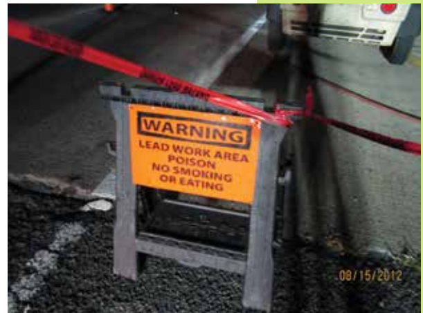
Warning signs for employees sandblasting lead paint from a bridge.

South Carolina OSHA co-sponsored, along with 11 other groups, the statewide Fall Protection Stand-down that took place on June 7, 2014. Construction employers were asked to shut down the jobsite and discuss the prevention of these types of injuries by having a training session, toolbox talk, or another safety activity, such as conducting safety equipment inspections, developing rescue plans, or discussing job-specific hazards. The following companies participated: Choate Construction, Gilbane Construction, Harper Corporation General Contractors, KBR Group, MB Kahn, McCrory Construction, Nucor Berkeley, Nucor Building Systems, Skanska Construction, Thompson Construction, and Trident Construction.