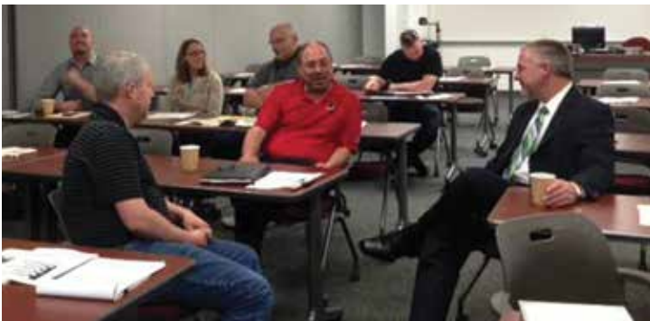
Monroe County Community College sponsored Coffee with MIOSHA in Monroe.

MIOSHA held “Coffee with MIOSHA” events at different locations statewide in 2013. These two-hour events provided an informal opportunity for employers and workers to meet with MIOSHA representatives (consultative and enforcement) to ask questions, obtain information on program services and resources, learn about MIOSHA Training Institute (MTI) opportunities, and establish rapport. All eight of the scheduled Coffee with MIOSHA events were successfully completed. Total attendance was approximately 500.