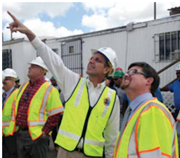
Eight new companies joined the Door to Door in the Construction Industry initiative in 2013.

We continued providing employers and employees with information, guidance, and trainings that will help employers and employees build and maintain a safe worksite.