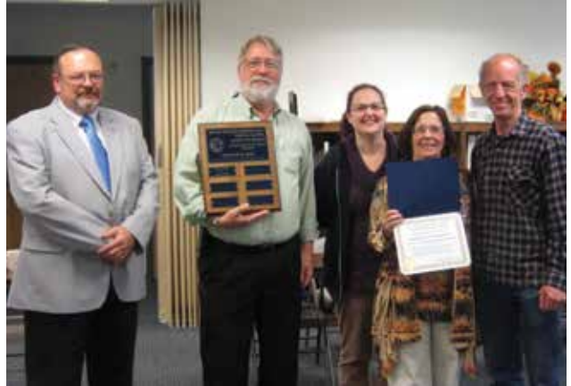
A SHARP presentation for Mat-Su Health Services, Inc., was held July 2, 2014.

Alaska OSHA's VPP program continues to maintain the highest standards for participation in the program. There are 11 participants at the Star level.