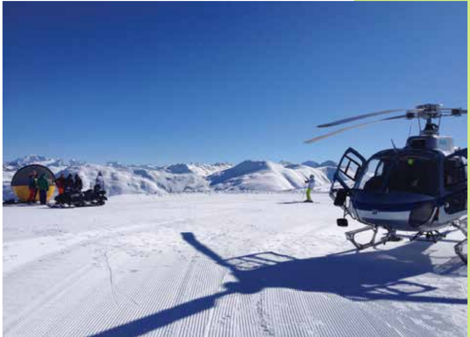
AKOSH is focusing on boosting safety awareness in the skiing and outback industries.

Awareness, awareness training, and recognition have been topics with employers and public works in the past year. An increase in requesting aid from AKOSH has excelled. Other state departments have seen a need for accountability in the assurance of safety for their reporting. For instance, the division that has compliance officers inspecting fish processors has requested training of the AKOSH 10 course for seafood processing. This has also triggered the other divisions that have investigative officers in the field that are exposed to these types of hazards.