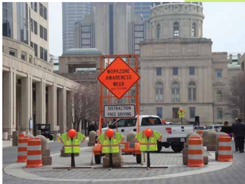
In April 2014, IOSHA joined the Indiana Department of Transportation for Work Zone Safety Awareness Week.

The Deep Rock Tunnel project is located in Indianapolis. On June 13, 2014, one employee suffered a fatal head injury while operating a locomotive 300-plus feet below the surface and approximately eight miles into the tunnel. This case is ongoing.