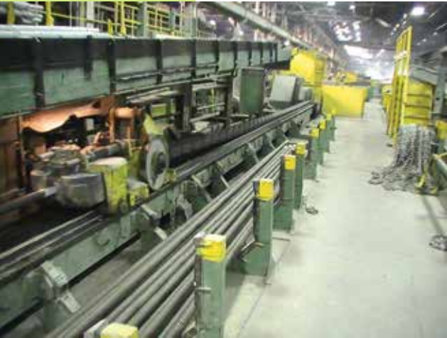
Employees enter the bunk area to attach slings to steel and are exposed to multiple unguarded pinch points from the falling steel bars, pulling carriage, and pusher bar above. These actions have resulted in one fatality and finger amputations.

finger amputations. The company manufactures cold drawn tubes and piping for use in various industries from automotive and aircraft components to oil and natural gas. As a result of the inspection, two willful-serious, two serious, and one other-than-serious violations with penalties totaling $151,000. The most serious violations included lockout/tagout and unguarded pinch points.