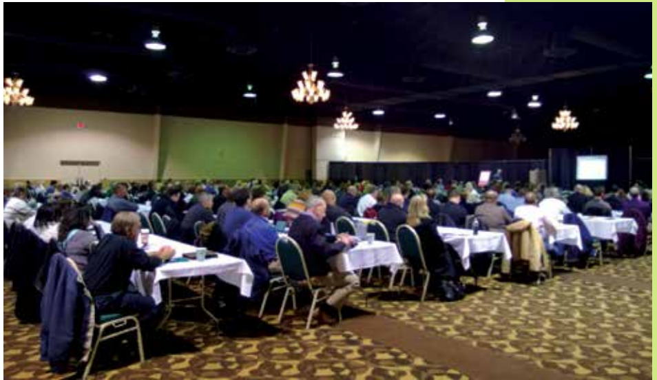
The Kentucky Labor Cabinet participated in a training on workplace violence, which covered active shooter situations and self-defense.

Reporting: The Kentucky OSH Program has a state-specific injury reporting regulation that is more stringent than OSHA's. Employers are required to report hospitalizations of two or fewer employees as well as all amputations to the Division of OSH Compliance. In fiscal year 2013, the Division of OSH Compliance received 109 hospitalization reports. Fifty-seven inspections were conducted, resulting in one willful serious violation, two repeat serious violations, 60 serious