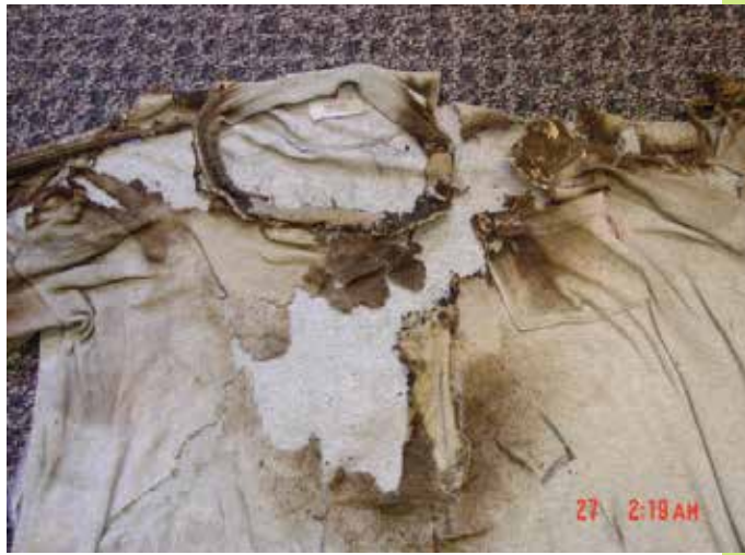
An electrician suffered serious burns after an arc flash incident in 2013.

While the co-worker hooked up a meter to verify that the system was working, the technician got a camera, returned to the platform, and began raising the boom to photograph their completed work. He was operating the lift on an eight- to 10-degree slope with counterweight on the