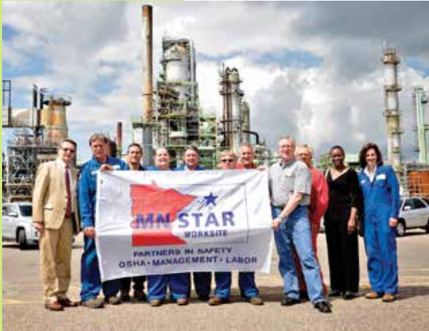
MNOSHA ended 2013 with 35 employers achieving MNSTAR status.

In FFY 2013, four new organizations in Minnesota achieved full MNSTAR status. In addition to these new participants, four employers received full recertification, with the associated five-year