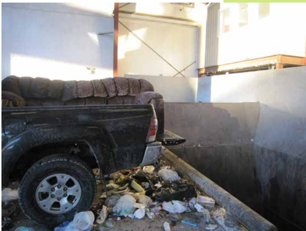
A citizen was crushed after falling into an unguarded trash compactor.

Also this year, CONN-OSHA responded to a referral involving a serious injury to a temporary worker at a publicly owned golf course. The worker attempted to clean out a lawn tractor while the tractor's cutting system was still in operation. The investigation determined that the seat safety interlocks were disabled by the employer. A willful violation was issued under the general duty clause for intentionally disabling the safety interlocks on the mowers.