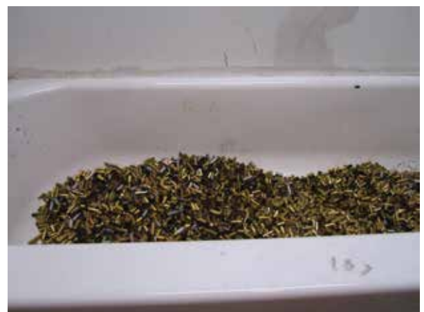
Spent shell casings at the range.