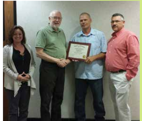
SCATS trainers present the latest recipient of the Safety and Health Practitioner Program.

Nevada enacted legislation in 2009 that made it mandatory for all construction workers engaged in construction activities in the state to have an OSHA 10-Hour construction card and supervisory employees to have an OSHA 30-Hour construction card, which both last for five years after the completion of the class. SCATS recently created a free refresher course to accommodate the high volume of employees whose cards are approaching expiration.