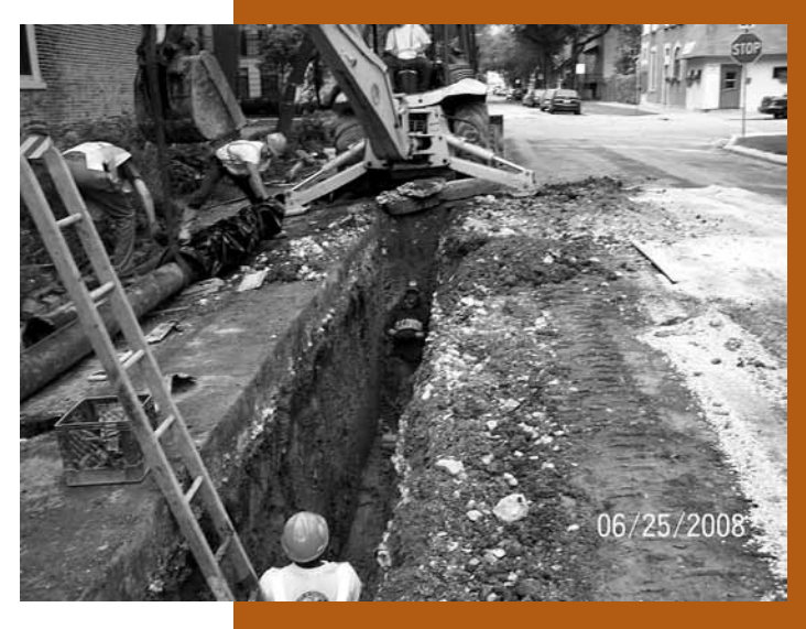
As a result of this trench inspection, a large municipal water management agency was issued four Serious Citations.

The Illinois program has one year left to meet the developmental steps outlined in the State Plan application and will be using these parameters in lieu of a performance plan until that time.