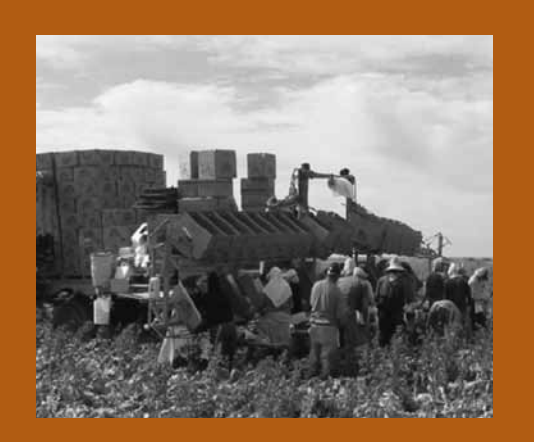
Cal/OSHA intensified enforcement of the heat illness standard during the summer months by increasing targeted inspections of industries with outdoor employment.

The Cal/OSHA Process Safety Management Units proactively initiated a California Emphasis Program (CEP) on April 14, 2010, under which Program Quality Verifications (PQV) were conducted on 11 out of 12 California petroleum refineries to examine each refiner's procedures and practices for identifying and mitigating corrosion damage known to be produced in the NHT process environment. The PQV focused on the NHT process units in