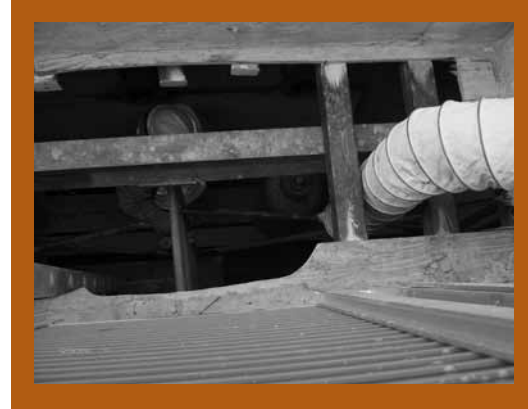
An explosion occurred at the bottom of this wet well, injuring three Posen employees.