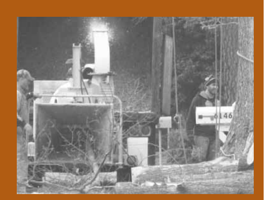
Tree Trimming Operations in Virginia - Employees without proper PPE or training.

While enforcing the Virginia unique Overhead High Voltage Power Lines (OHVPL) standard remains an important emphasis program, in the last year we have stressed compliance with the new Virginia unique standard on Reverse Signal Operation Safety Requirements for Motor Vehicles, Machinery and Equipment in General Industry and the Construction Industry, 16VAC25-97, and the new Tree Trimming Operations standard, 16VAC25-73, to ensure the maximum knowledge and compliance with these important programs. Enforcement of the new Tree Trimming Operations standard, 16VAC25-73, has had a significant impact on the arborist industry. Virginia continues with other local emphasis inspection programs to address the major causes of fatal and serious non-fatal accidents in the following areas: fall hazards in construction; scaffolding; heavy construction equipment, lumber and wood products; waste water and water treatment facilities; and use of workers' compensation accident reports to identify specific occurrences such as amputations, serious chemical exposures, etc. Virginia participates in the following National Emphasis Programs (NEPs): amputations; lead; combustible dust; crystalline silica; and trenching and excavation. Thus far, VOSH has conducted 871 emphasis program-related inspections in the Commonwealth.