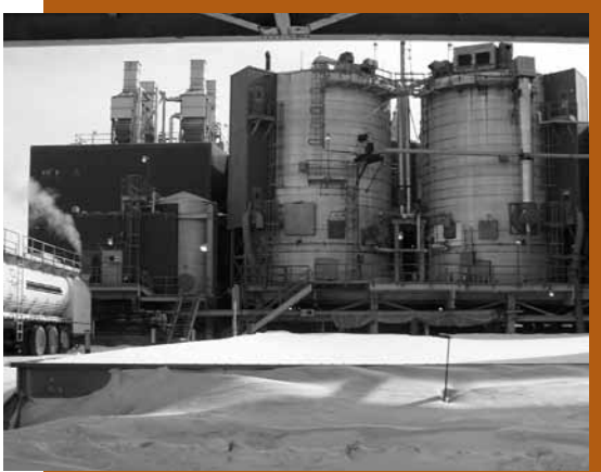
Processing facilities at the Kuparuk Oil and Gas Field VPP Site.