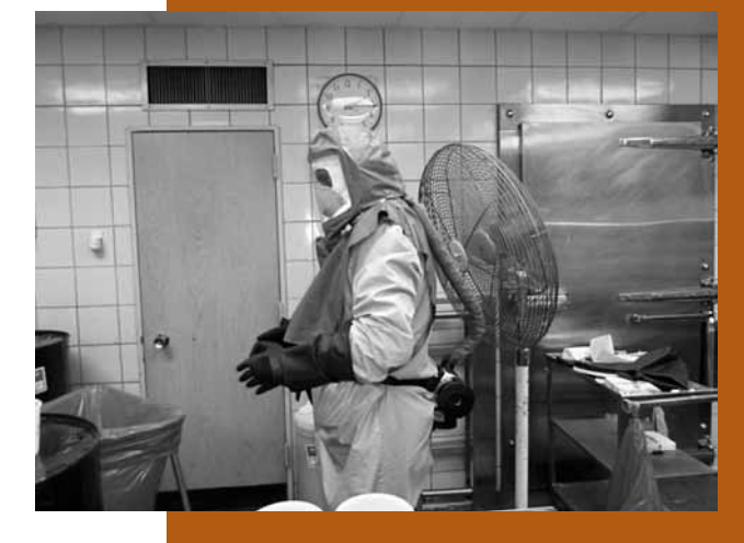
A MOSH Industrial Hygienist conducts formaldehyde sampling at a local hospital.

The training and education unit is fortunate to have two training rooms at our new facility in Hunt Valley, MD. These rooms are equipped with state-of-the-art audiovisual equipment that allows our instructors to use the most up-to-date tools to present their information. Our large training room is capable of holding 52 students (74 with students seated around the perimeter of the room), this is almost double the amount of students from our previous facility in Laurel, MD.