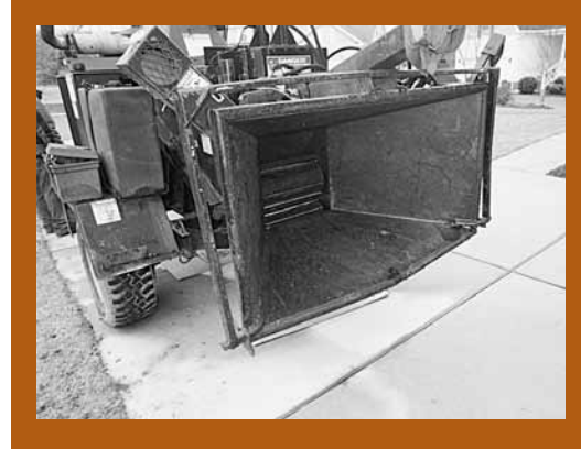
A 14-year-old boy was fatally injured after being pulled into this chipper.

As a result of the investigation, the VOSH Program issued two willful and 12 serious violations and $185,500 in penalties. Criminal charges were also filed for child endangerment and a criminal willful violation of VOSH regulations. The employer pled guilty to the criminal willful violation. The civil case is still pending.