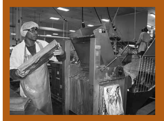
2011 Workplace Safety & Health Calendar: To protect employees, Trident Seafoods' Pier 91 facility makes sure cutting and chopping machines are well guarded.