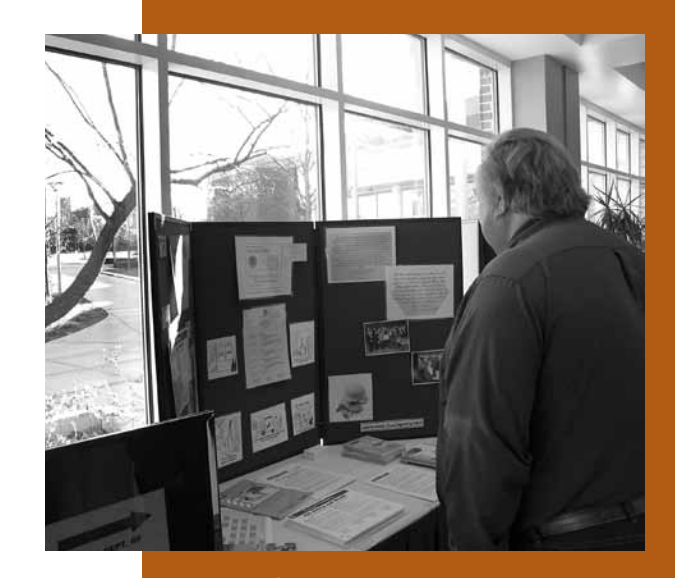
Display of SIED materials at an outreach seminar at Harper College.