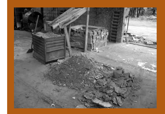
Welch Group Environmental: The Melting Operation.