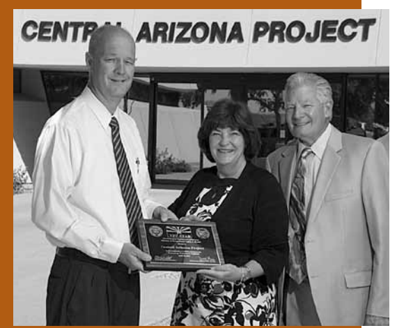
ADOSH presentation of the VPP recertification to the Central Arizona Project.

Voluntary Protection Program: ADOSH has 32 VPP (general industry and construction) participants at STAR level. During FY2010, ADOSH approved five new sites and re-evaluated seven. New STAR participants include: Yuma Cogeneration Associates, 2/25/10; Printpack Inc., 2/25/10; Raytheon Missile Systems Palo Verde, 4/20/10; Cintas Corporation Location 696, 9/28/10. Hunter Contracting Company, 8/30/10 was approved as the third Construction-VPP participant. The Central Arizona Project was one of several employers receiving their VPP recertification award.