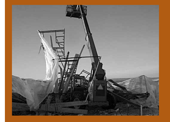
A Grand Traverse Construction employee was struck and killed by this scaffolding that overturned due to high winds.

Posen Construction: On June 6, 2011, the Construction Safety and Health Division issued three Willful violations, three Repeat Serious violations, and five Serious violations to Posen Construction for alleged safety hazards with total penalties of $199,200. On Dec. 23, 2010, three employees placed concrete in the bottom of a wet well and left a propane torch device running overnight to dry the concrete. The torch went out and filled the confined space with propane gas. At about 8:00 a.m. the employees attempted to relight the heater and an explosion occurred. All three employees suffered burns and were transported to a hospital.