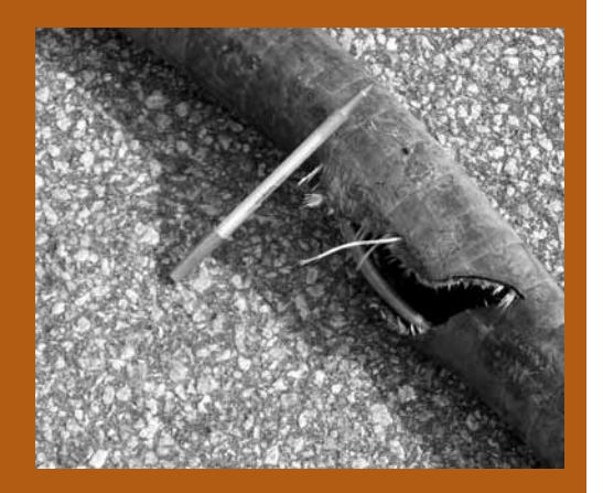
A transfer hose burst, releasing a heavily concentrated cloud of ammonia gas.

Tanner Industries is covered under OSHA's Process Safety Management (PSM) standard due to the amount of anhydrous ammonia used in their process. It was determined that Tanner had not completed a Process Hazard analysis nor had they developed Standard Operating Procedures for the ammonia transfer process.