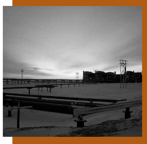
Alaska North Slope BP Gas Processing Facility.

AKOSH maintained 16 VPP sites in 2010 and 17 SHARP sites. These recognition programs continue to produce tremendous results, as participants are committed not just to meet AKOSH standards, but to exceed them in a positive, cooperative environment.