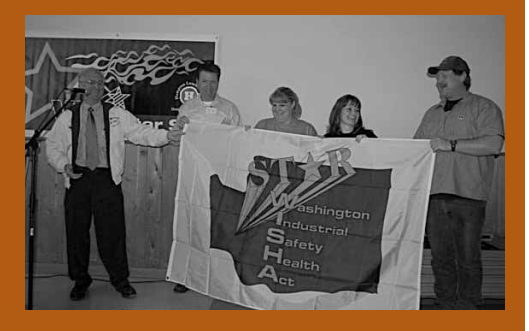
The Hampton Mills VPP celebration was held on May 13, 2010.