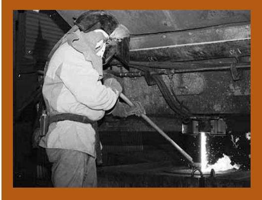
2011 Workplace Safety & Health Calendar: This worker at NuCor Steel in Seattle wears protective gear that includes flame-resistant clothing and a full-face respirator with a powered air filter.

2012 Job Safety & Health Calendar: For the 6th year, Washington has developed a 2012 Workplace Safety and Health Calendar containing weekly safety tips. Local businesses throughout the state were visited to take photos of actual workers doing their jobs in various industries. http://www.lni.wa.gov/IPUB/417-231-000.pdf