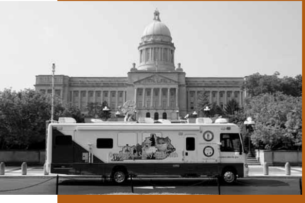
KYOSH IMPACT is used for outreach as well as strategic enforcement efforts.

Labor Cabinet Regional Seminars: In an effort to keep citizens abreast of the services offered by the Kentucky Labor Cabinet, the Cabinet hosted a series of six multi-day seminars across the Commonwealth during the summer of 2010. The seminars showcased all of the Cabinet's agencies and was developed for employers, employee organizations, public works projects, workforce development, workforce education, and registered apprenticeship programs. The Division of Compliance and the Division of Education and Training provided attendees with detailed presentations of their many-faceted services as well as explanations of various statutory and regulatory mandates. The seminars were well received and attended by over 600 participants.