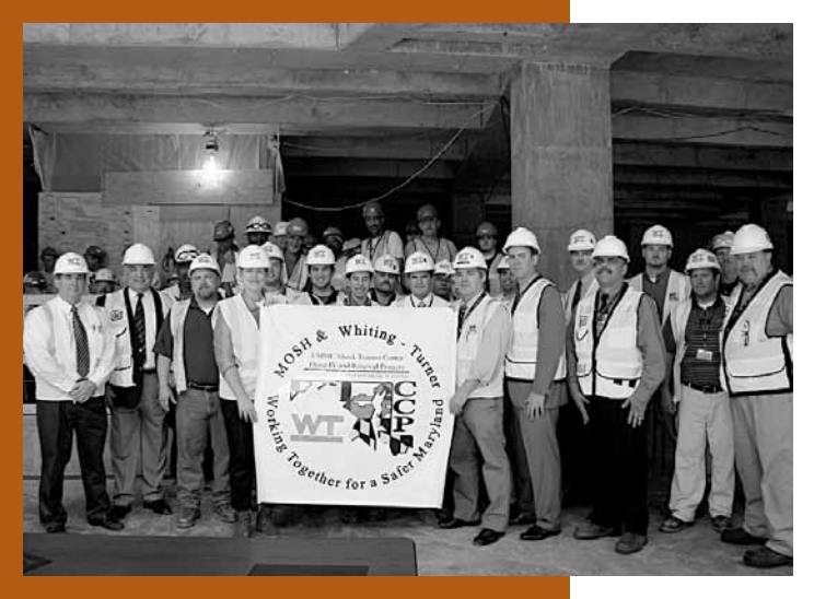
MOSH Commissioner and Assistant Commissioner at a signing ceremony for a new CCP partnership.

injury and illness cases per 100 equivalent full-time workers. This represents a decline of slightly over two-thirds (68%) from the series high of 10.6 recorded in 1972. Private sector construction's TRC rate declined three percent from 3.9 cases reported in 2008 to 3.8 in 2009 and was also the lowest rate on record for this industry sector in Maryland since the survey program's inception in the early 1970s.