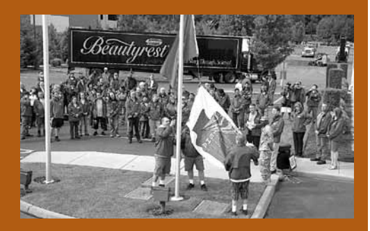
The Simmons VPP celebration was held on September 1, 2010.

Governor's Industrial Safety and Health Conference: Washington's 60th annual Governor's Industrial Safety and Health Conference was held on September 28-29, 2011, at the Tacoma Convention Center. This year the 1,500 attendee conference offered two days of training and education, special recognition of 100 years of the Worker's Compensation Act and had over 80 exhibitors providing the latest tools, technologies, and strategies for workplace safety and health.