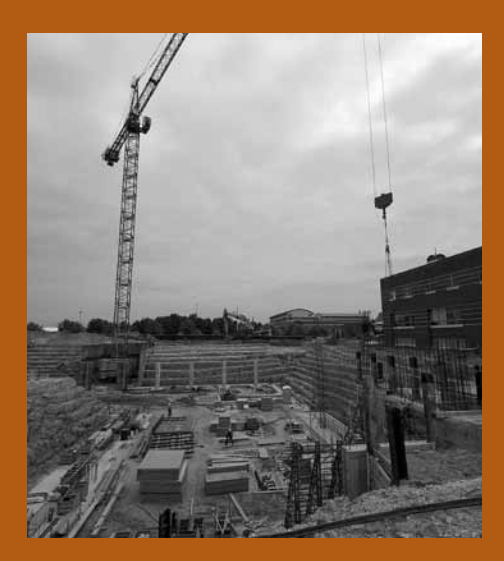
Pioneer Construction signed a partnership to protect workers at Grand Valley State University.