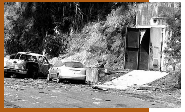
This is the entrance to the bunker where fireworks were stored and the explosion occurred.

On April 8, 2011, an explosion at a storage bunker used to store contraband class 1.3G fireworks seized by the Bureau of Alcohol, Tobacco, and Firearms, claimed the lives of five workers and injured another.