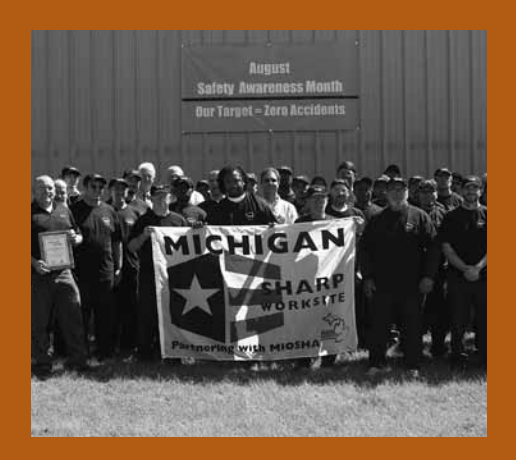
Siemens Industry Metallurgical Services in Benton Harbor Received the Michigan SHARP Award.