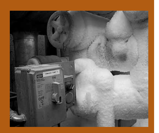
Excessive ice build up on valves was a PSM violation at Select Onion.