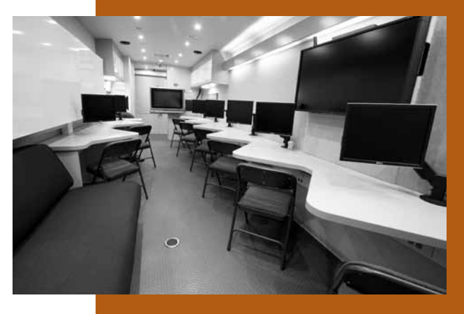
KYOSH IMPACT is a state-of-the-art multi-purpose incident response/outreach motor coach.