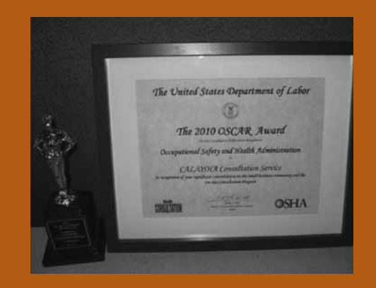
In April of 2010, the Cal/OSHA Consultation Program received its third OSHA Consultation Achievement Recognition (OSCAR) award from Federal OSHA.

Partnerships have been extremely beneficial in helping Cal/OSHA reach out to industries and maximize our resources. In April of 2010, the Cal/OSHA Consultation Program received its third OSHA Consultation Achievement Recognition (OSCAR) award from Federal OSHA. The award was granted to recognize the success of a project designed to educate Hispanic/Latino employers and workers on relevant health and safety requirements as well as best practices to conduct their work safely. Cal/OSHA Consultation earned this award by partnering with insurance carriers, construction and agricultural associations as well as individual employers who shared our views in the importance of education, training and targeted outreach.