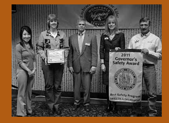
During the Governor's Safety Awards Conference, awards were presented to 10 companies with outstanding safety and health programs.