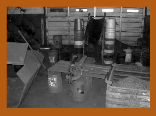
Welch Group Environmental: The Chute System.

North American Midway Entertainment: On October 11, 2010, South Carolina OSHA responded to a worker fatality at North American Midway Entertainment.