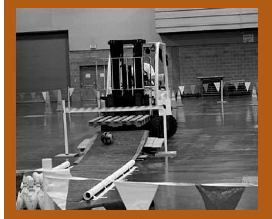
The Columbia Forklift Challenge debuted at the Oregon GOSH conference, where operators negotiated tight turns, stacked pallets and containers, and went bowling.

Historically, there has been high demand for training from businesses that employ Spanish-speaking workers. Oregon OSHA offers a number of materials in Spanish as part of its PESO program. The program includes 17