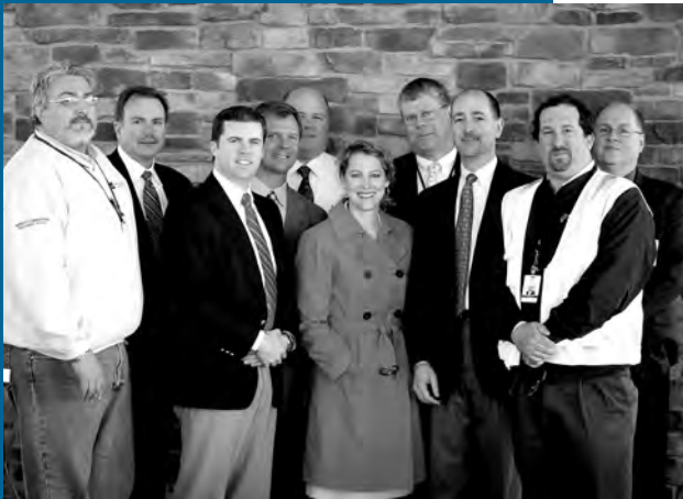
IOSHA signs a partnership agreement with Weigand Pepper JV covering the construction of the Parkview Regional Medical Center in Fort Wayne.

Three new occupational safety and health partnerships were also signed in 2009. New partnerships include EH Construction and the demolition/remodel of an elementary school in southern Indiana, Weigand Pepper JV and the construction of a regional medical complex in Fort Wayne, Indiana, and Meyer Najem and the construction of an orthopaedic surgical center in Greenwood, Indiana. The IDOL's partnerships have been an excellent tool for interacting with and reaching out to small subcontractors on jobsites as well as seeing best practices utilized by construction managers.