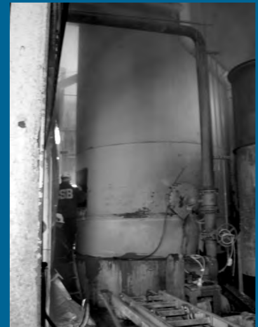
An explosion at the ConAgra Foods potato processing facility in Boardman claimed the life of a welder repairing a leak in a steel tank.

Facebook page: Oregon OSHA launched a Facebook page in the fall of 2009 to provide followers exclusive content, such as links to safety and health tips and conference discussions. The page also includes links to upcoming events, photos, and agency news.