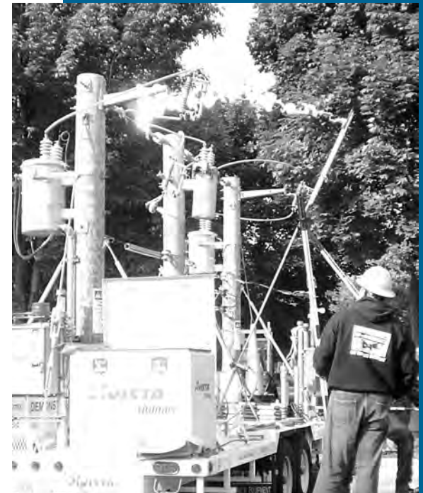
This high-voltage demonstration was part of the Governor's Industrial Safety and Health Conference.

Education: The DOSH Employer Education Workshop Program provides safety and health-related educational workshops at no cost to employers throughout the state. During 2009, the Employer Education Workshop Program held 175 workshops with an average attendance of 10 people per workshop.