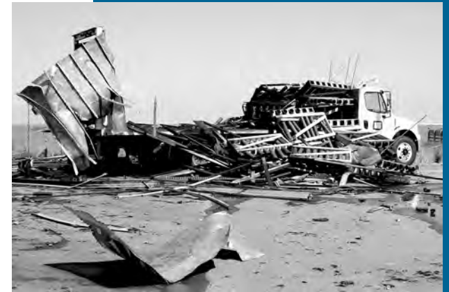
Debris in the aftermath of the fireworks explosion that killed four employees.

The investigation documented the need to evaluate the safety and health record of subcontractors hired to do work, and the dangers of allowing gas to vent into an enclosed room where a source of ignition is present. This investigation and others across the country documented the danger of venting gas in an enclosed room and have resulted in rule changes that prohibit this activity.