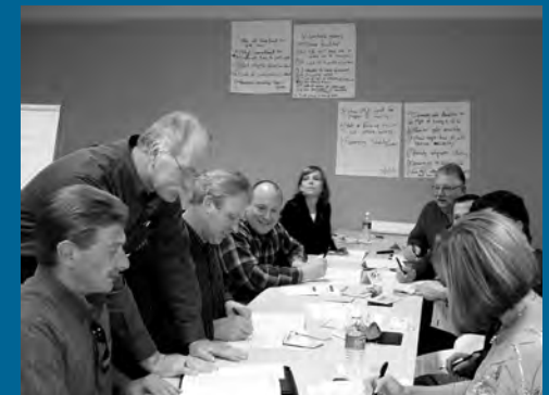
Students participate in a group activity during an MTI Level Two course.

Connecting MIOSHA to Industry – MIOSHA is continuing its very successful initiative, “Connecting MIOSHA to Industry.” The goals are to support proactive safety and health systems, decrease workplace safety and health hazards, expand partnership opportunities and, therefore, increase the competitiveness of Michigan employers. Overall, the initiative is linking MIOSHA’s legislative mandates with opportunities to interact with employers and workers to create collective ownership for the safety and health of Michigan’s workforce. “Connecting MISOHA to Industry” is increasing our program effectiveness by ensuring that interventions are educational, informative and useful-whether conducted by enforcement or consultation staff.