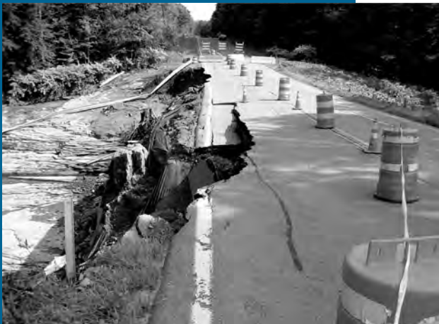
Bridge damage due to water surge from the 2009 Chautauqua County floods.

Empire 2009 Radiological Exercise: This was a multi-agency exercise involving state, local and federal agencies. The exercise scenario was based on the detonation of two radiological dispersal devices in the downtown Albany, New York area. The DOSH role was to assist the Safety and Health Manager, assist with radiological sampling and monitoring and to develop a Health and Safety Plan for the exercise.