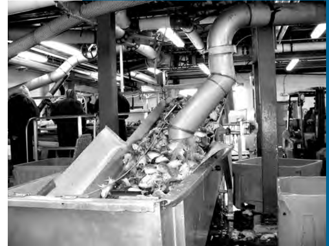
Trident Seafoods (SHARP company) processing facility.

In addition to outreach efforts, seafood processing will be targeted for enforcement inspections over the next five years beginning in 2009. In 2009, 12 seafood processors received enforcement inspections and 33 received consultation services. Three seafood processing sites qualified for the Alaska Safety and Health Achievement Recognition Program (SHARP) in 2009, which represents the first participation in SHARP for the seafood processing industry in Alaska. Trident Seafoods has demonstrated significant commitment and leadership by entering a partnership agreement with AKOSH, qualifying two plants for SHARP and reducing its total recordable case rate from 7.6 in 2007 to 3.46 in 2009. The loss time injury and illness rate for the seafood processing industry in Alaska was reduced from 4.91 to 4.06 or 17% in 2009.