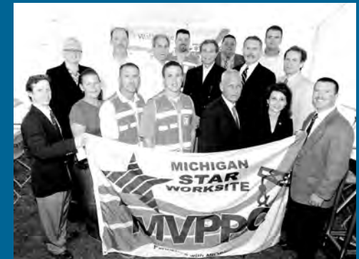
Walbridge is the first construction company in Michigan to receive the MVPP for Construction Star Award.

Alliances: The MIOSHA Alliance program was launched in FY 2004 and MIOSHA has 15 active alliances . They have generated hundreds of opportunities to improve the worksites represented by the signing organizations.