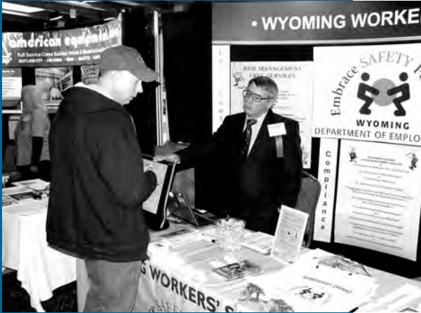
Wyoming's fourth annual Governor's Safety Awards Conference was held in April 2009.