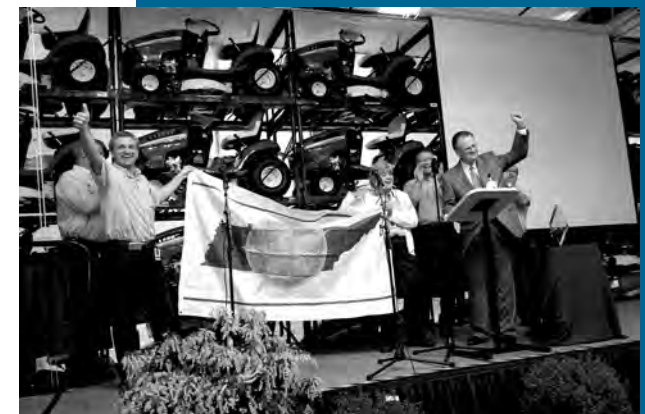
John Deere celebrates receiving the Tennessee VPP Star Award.