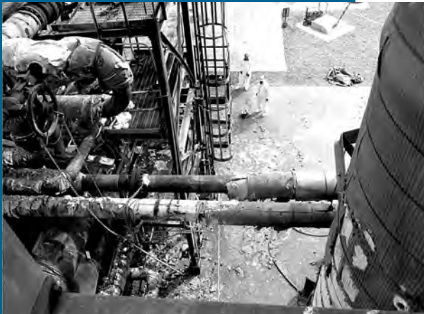
An explosion at the Tesoro Petroleum Corp. refinery in Anacortes fatally injured seven workers.

The investigation into the Tesoro explosion will be thorough and could take up to six months to complete. As a regulatory body, the DOSH team will not only work to determine what led to the incident, but also whether the employer violated any workplace safety rules that may have been a factor in the incident.