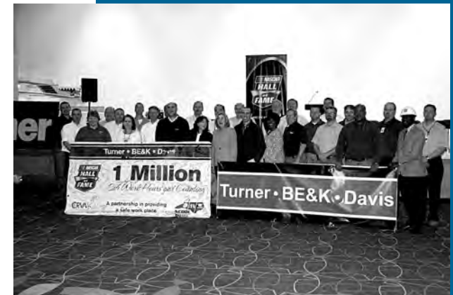
A safety and health celebration at the NASCAR Hall of Fame with company employees and the North Carolina Department of labor.

In cooperation with alliances formed with the NC State University Industrial Extension Service and the NC Safety and Health Council, the Manager of Environmental, Safety and Health (MESH) and the Construction Manager of Environmental, Safety and Health (C-MESH) certificate programs successfully continued during the year. Development of the Public Sector MESH certificate program began in 2009 with implementation in 2010.