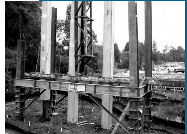
Bridge construction pile driving fatality.

Fatality Case - Site/Activity taking place at time of incident: Company was driving piles for construction of a bridge crossing over a creek. Shortly after lunch time the piling hammer was test fired and after it was determined that the soil was stable the pile driving began. At this time the employee, a carpenter assigned to construct forms across the creek from the piling operations, climbed onto the piling template to watch the pile driving activity. After three or four strikes of the hammer, the concrete pile suddenly sank four to five feet into the ground, causing the pile to fall faster than expected, and away from contact with the hammer. As a result, the hammer also dropped, striking the top of the pile on the top right side causing the hammer and leads to abruptly swing to the right of the piling being driven. When the legs of the leads, which were resting on the metal elevated template, kicked out at the bottom, the lowest cross brace on the leads struck the employee in the face and head, pinning him to a concrete piling already driven.