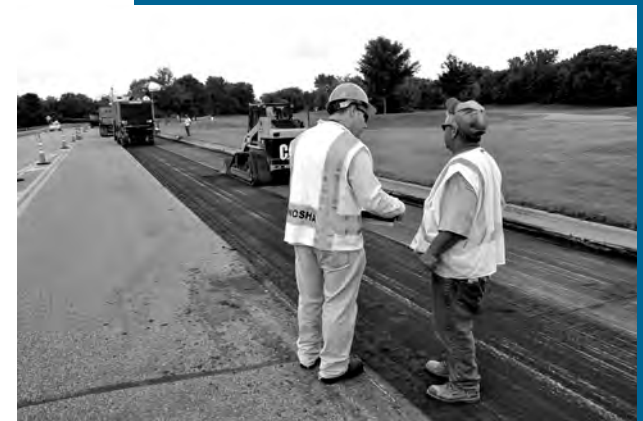
In 2009, Minnesota OSHA Compliance conducted inspections under 18 local and national emphasis programs.

A trench emphasis inspection resulted in two willful citations, three serious citations and penalties totaling $71,400. The willful citations were issued for failure of the competent person to identify and abate hazardous conditions, and exposing employees to cave-in/crushing hazards in an unprotected trench. Since 1999, seven inspections were conducted with this employer and MNOSHA issued citations for the lack of a competent person or part of this standard five times and for inadequate protective systems six times; some of those citations were repeat.