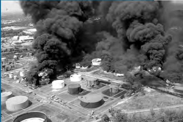
Explosion at the Caribbean Petroleum, Corp (CAPECO PR) on October 23, 2009.

Significant Case: Explosion at Caribbean Petroleum, Corp (CAPECO PR): On October 23, 2009, at 12:30 a.m., the Bayamon area was rocked by an explosion. The company where this incident took place was engaged in the storage, transportation and distribution of gasoline, fuel oil, diesel, and jet fuel.