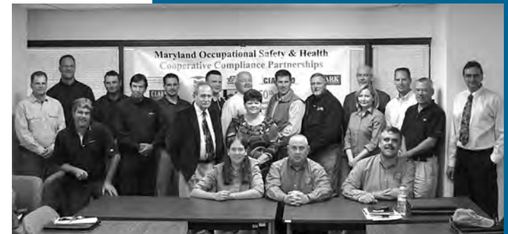
Maryland OSHA celebrated its 50th CCP Partnership in 2009.