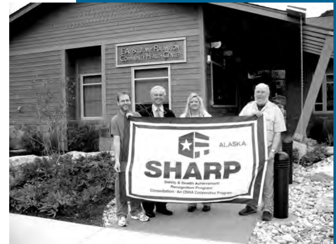
E.A. & Jenny Rasmuson Community Health Center earns SHARP status.

AKOSH established 16 VPP sites as of 2009 and maintained 16 SHARP sites. These recognition programs continue to produce tremendous results as participants are committed not just to meet AKOSH standards, but to exceed them in a positive, cooperative environment.