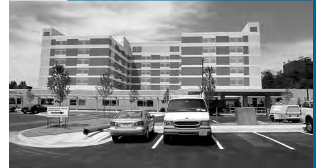
Franklin Square Hospital, a CCP Partnership site, is nearly completed.

2009 was a record year for MOSH injury and illness statistics. Based on the Survey of Occupational Injuries and Illnesses, a cooperative program between the State of Maryland's Division of Labor and Industry and the U.S. Department of Labor, Bureau of Labor Statistics, the data collected during 2009 revealed that for 2008, Maryland's private sector had an all time low Total Recordable Case (TRC) rate of 3.3 injuries and illnesses per 100 equivalent full-time workers. This represented a decline of slightly over two-thirds (68%) from 1972. Likewise, the construction industry's TRC rate went from 4.6 in 2007 to 3.9 in 2008. This represented a decrease of 15% and was the lowest on record for private sector construction in our state.