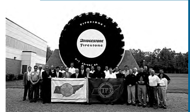
Bridgestone-Firestone receives the Tennessee VPP Star Award.

Training: During 2009, Tennessee OSHA trained more than 8,000 employees and employers on a wide range of safety and health topics. Most of this training was done in partnership with the Tennessee Chamber of Commerce and Industry, and the University of Tennessee.